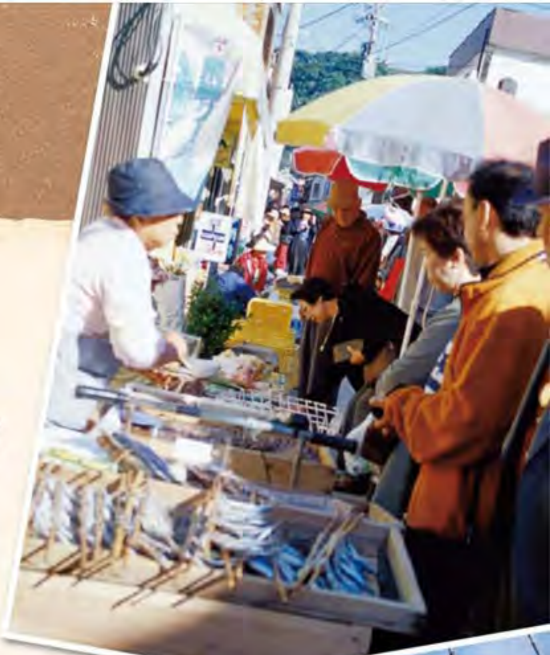
Yobuko's famous spinning squids

It is definitely worth getting up early to visit the market.